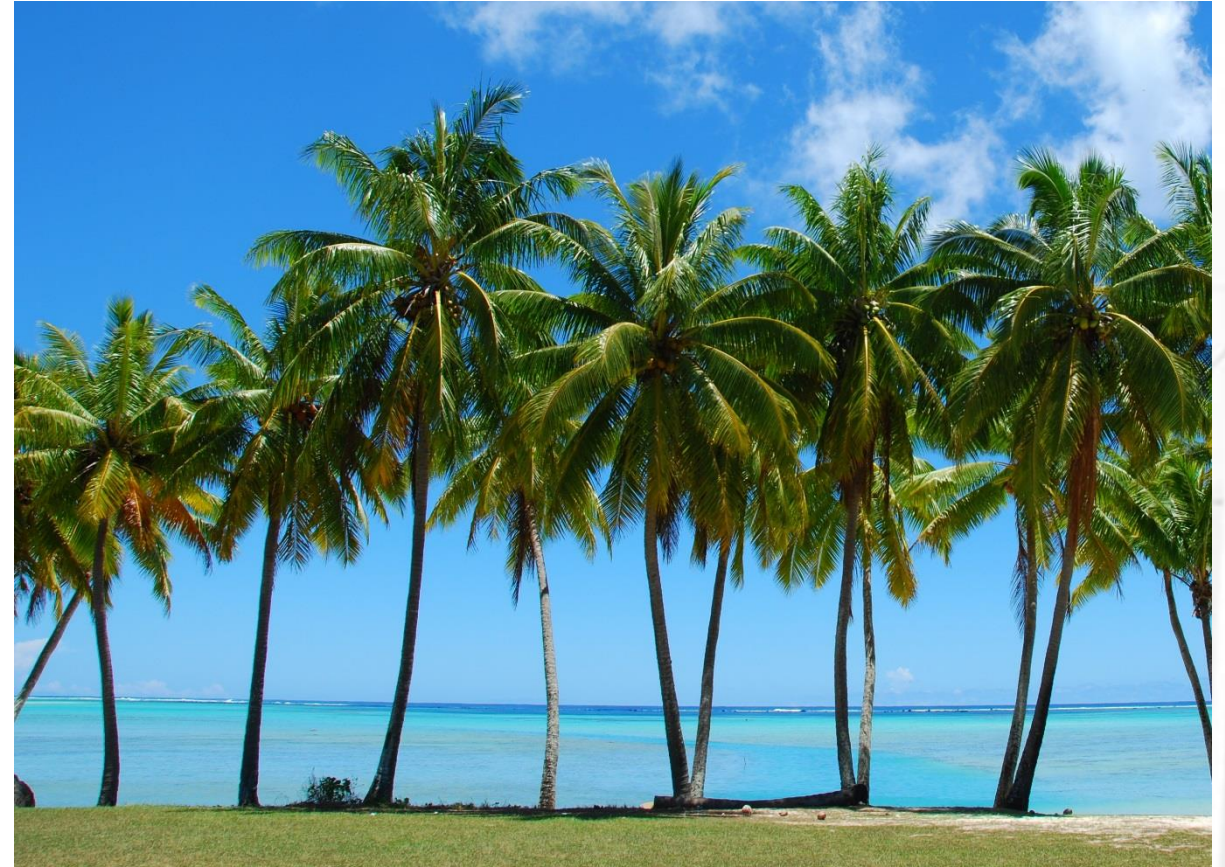
Malleable and Flexible