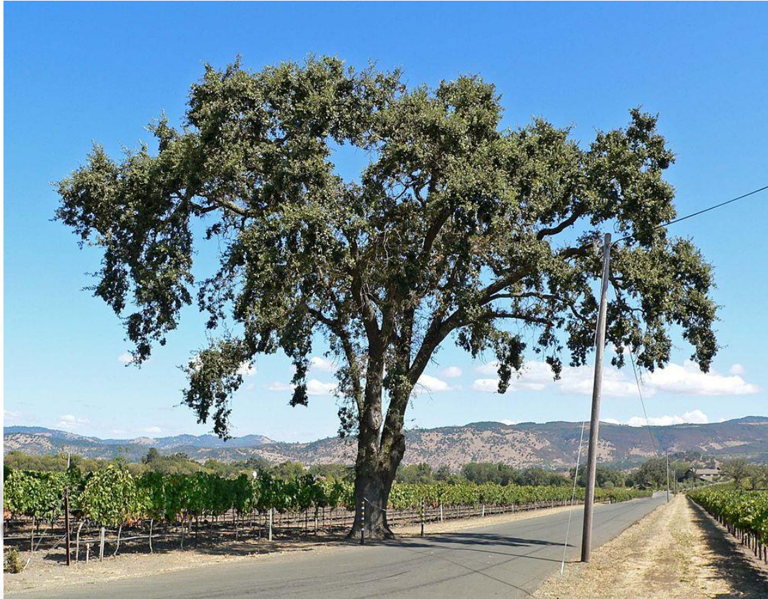
Strong and Unflexing